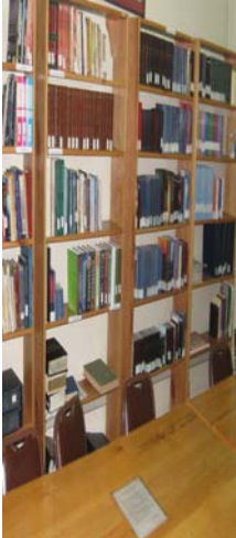
Ellen G. White SDA Research Centre, Northern Caribbean University