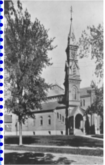
Dime Tabernacle , founded: April 20, 1879 –destroyed by fire: January 7, 1922